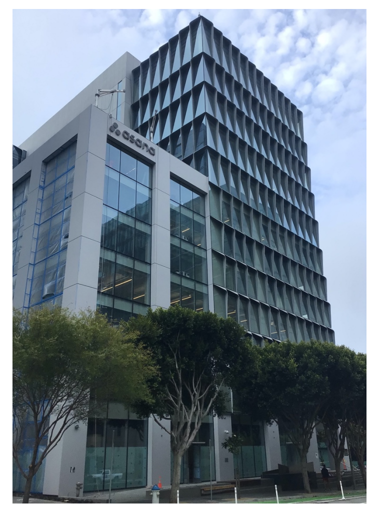
633 Folsom Street, San Francisco

Whether your building is a high-rise or mid-rise, Access Systems & Solutions, Inc. can provide you with a Cal-OSHA compliant Exterior Building Maintenance (EBM) / Window Washing System.