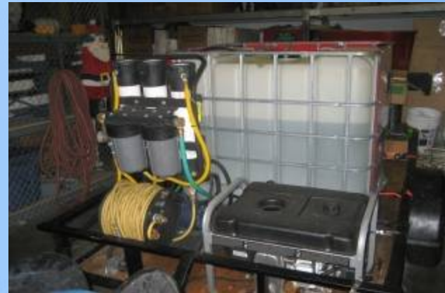
Vehicle or Trailer Mounted Systems