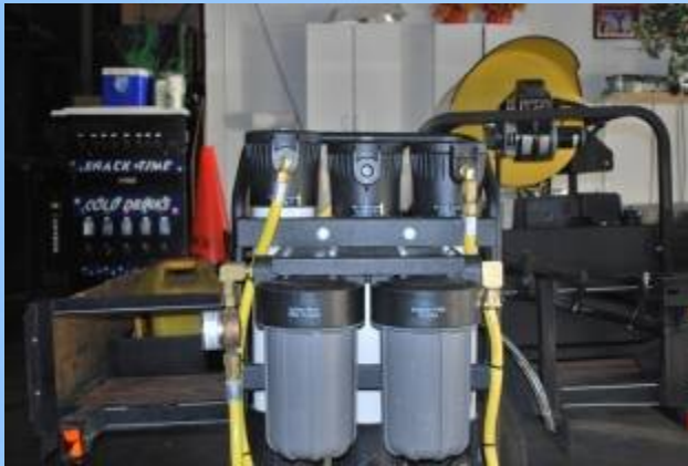
De-ionizing Cylinders, Columns, or Cartridges